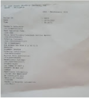
Transferred proof2.jpg 71K