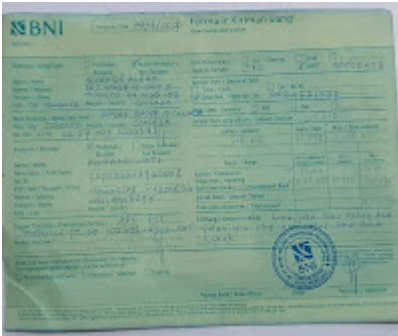
Transferred proof1.jpg 133K