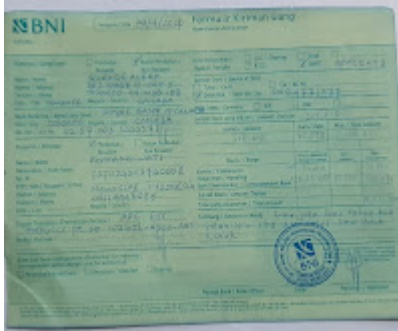
Transferred proof1.jpg 133K